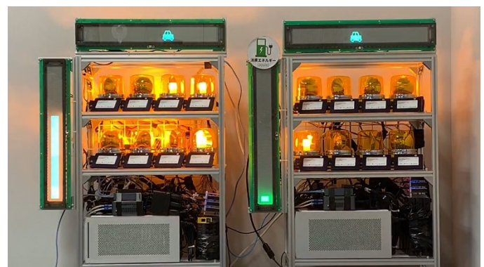
Fig 2. Super-energy-efficient database system.