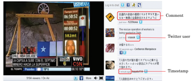
Figure 1: The snapshot of a Ustream live broadcast.

Inspired by the idea of "the wisdom of crowds" [6], we realize that if multi-viewers can annotate the videos just like what ESP